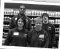
Meet our staff!